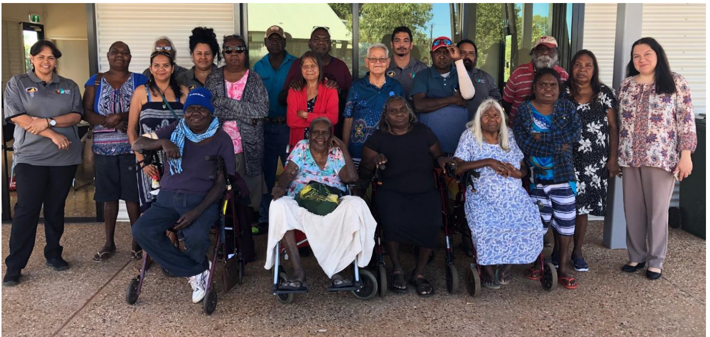
Participants of the Broome 'Yarning Kidneys' Community Consultation at Nyamba Buru Yawuru on the 15 August 2019.

Consultation meeting to inform the development of the Kidney Health Australia - Caring for Australasians with Renal Impairment (KHA-CARI) Guidelines for Management of Chronic Kidney Disease for Aboriginal and Torres Strait Islander Peoples