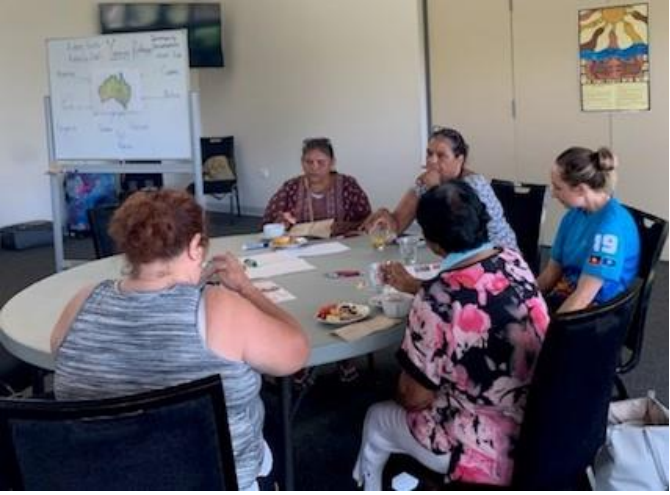
Ballina and the Northern Rivers of New South Wales Yarning Kidneys