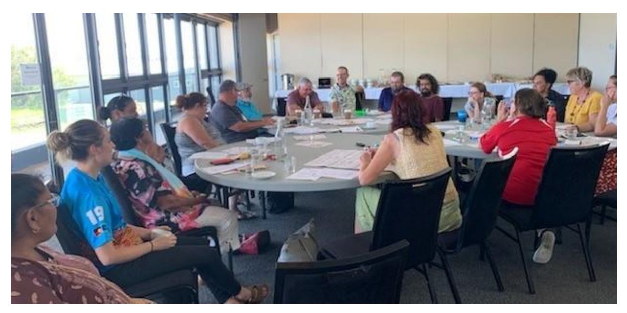
Ballina and the Northern Rivers of New South Wales Yarning Kidneys

At the end of the Yarning kidneys session participants were informed that feedback from the session would be used to develop the consultation report and that this would contribute to and inform the broader national consultation process. All participants were thanked for their attendance and participation.